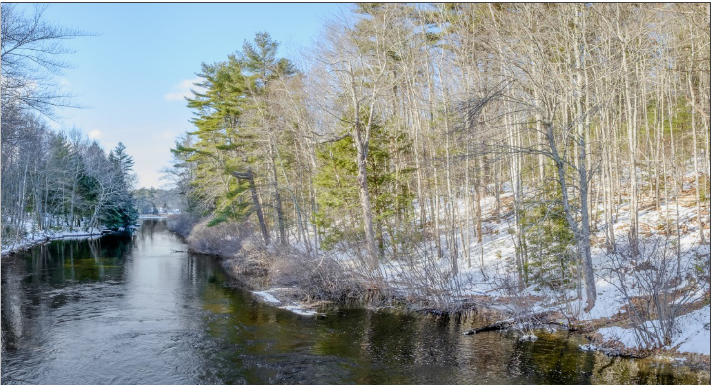
Cosima's Preserve protects 44.5 acres and about 1,300 feet of Pemaquid River shoreline, and it abuts a 130-acre parcel that PWA has protected by a conservation easement.